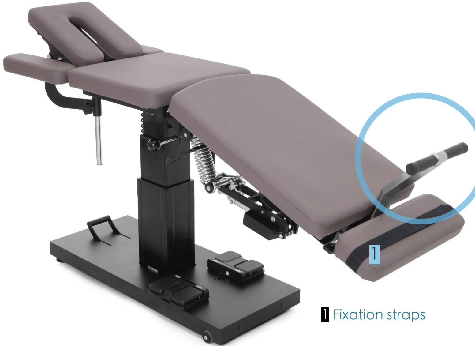
1 Fixation straps

When the patient's weight is equilibrated by the springs, the low back can be mobilized with minimum effort.